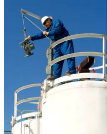
Right: Workers install emissions control equipment at an industrial facility to reduce escaping gas and improve plant efficiency.

Getting hired into a green job can pave the way for a successful career. Through apprenticeship and job placement programs, entry level workers can begin by assisting an engineer or repairman while gaining hands-on experience and working towards certification and journey-level status within a few years. This is an opportunity for someone who hasn't attended college to make more than $30 an hour in a secure field. Opportunities expand from there.