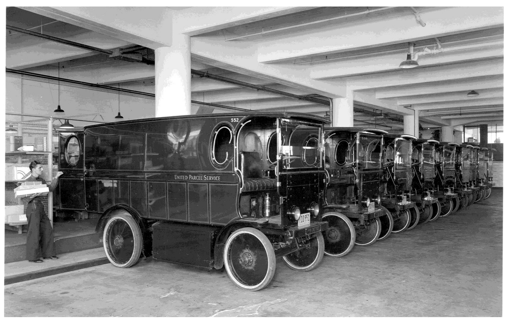
1936 Electric Vehicle Fleet - Manhattan, NY