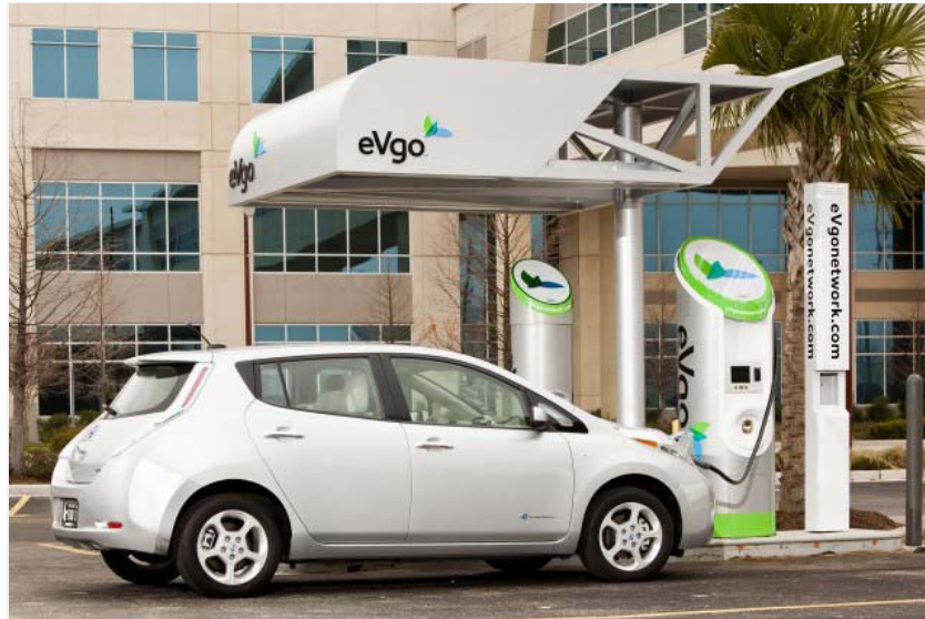
Nissan Leaf electric car with eVgo quick charging station.